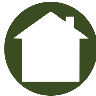
Stay Home if You Are Sick

Stay Informed Visit the following links or scan here