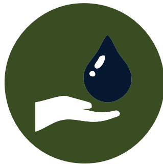
Wash & Sanitize hands